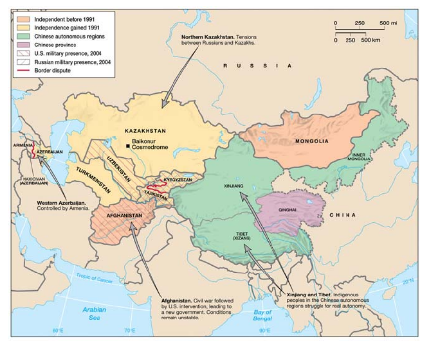
Copyright © 2006 Pearson Prentice Hall, Inc.